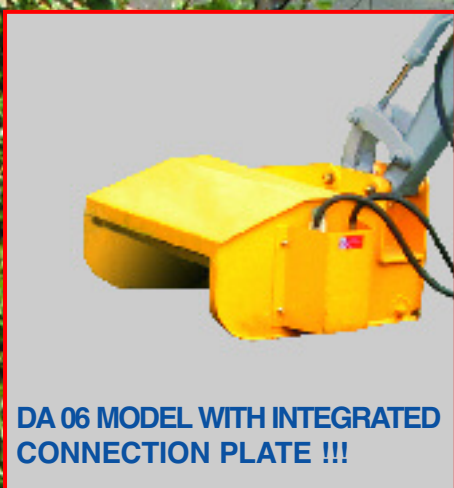
DA 06 MODEL WITH INTEGRATED CONNECTION PLATE !!!